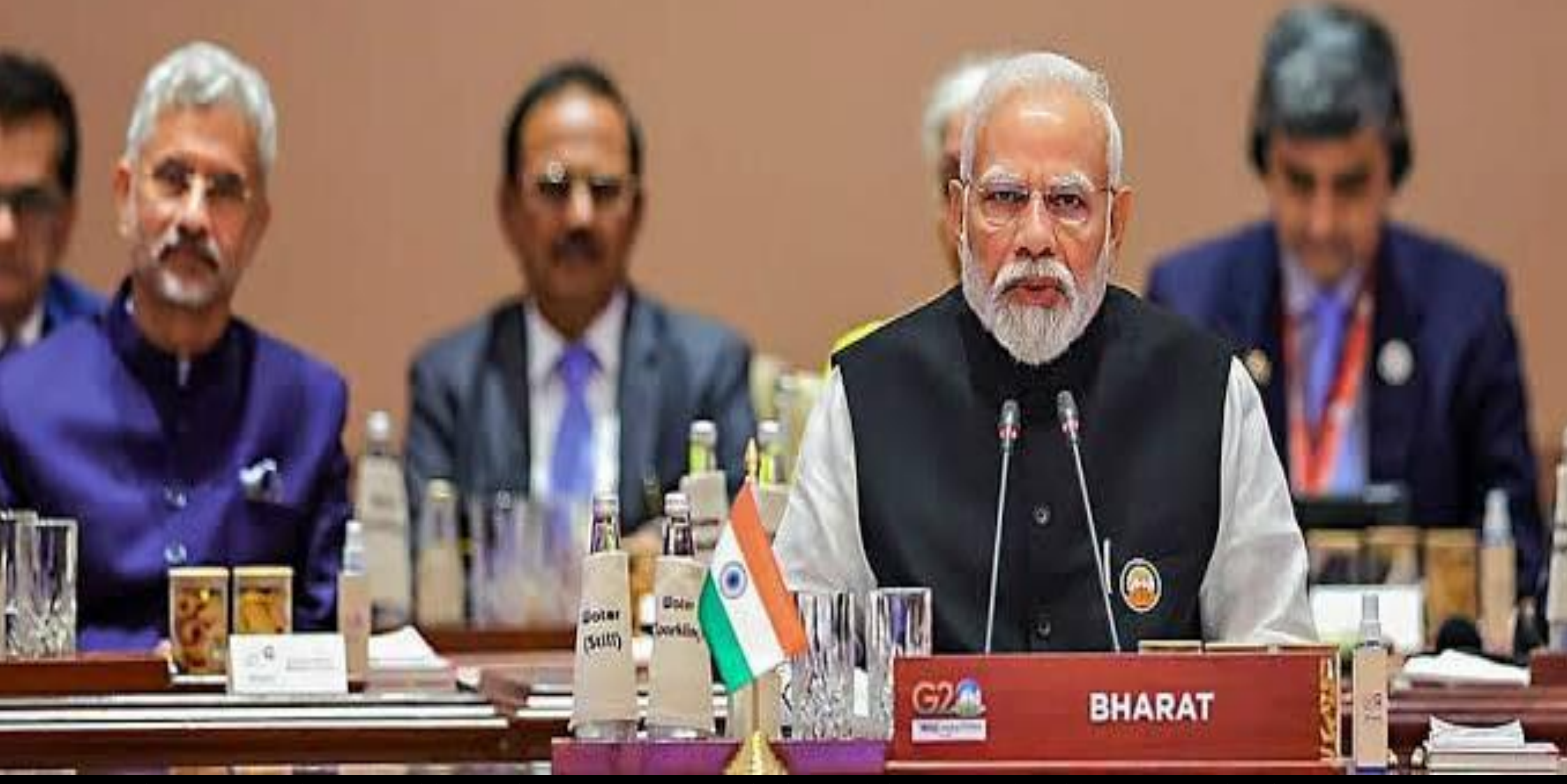
"The G20 presidency would help showcase parts of India beyond the conventional big metros, thus bringing out the uniqueness of each part of our nation."- PM Narendra Modi