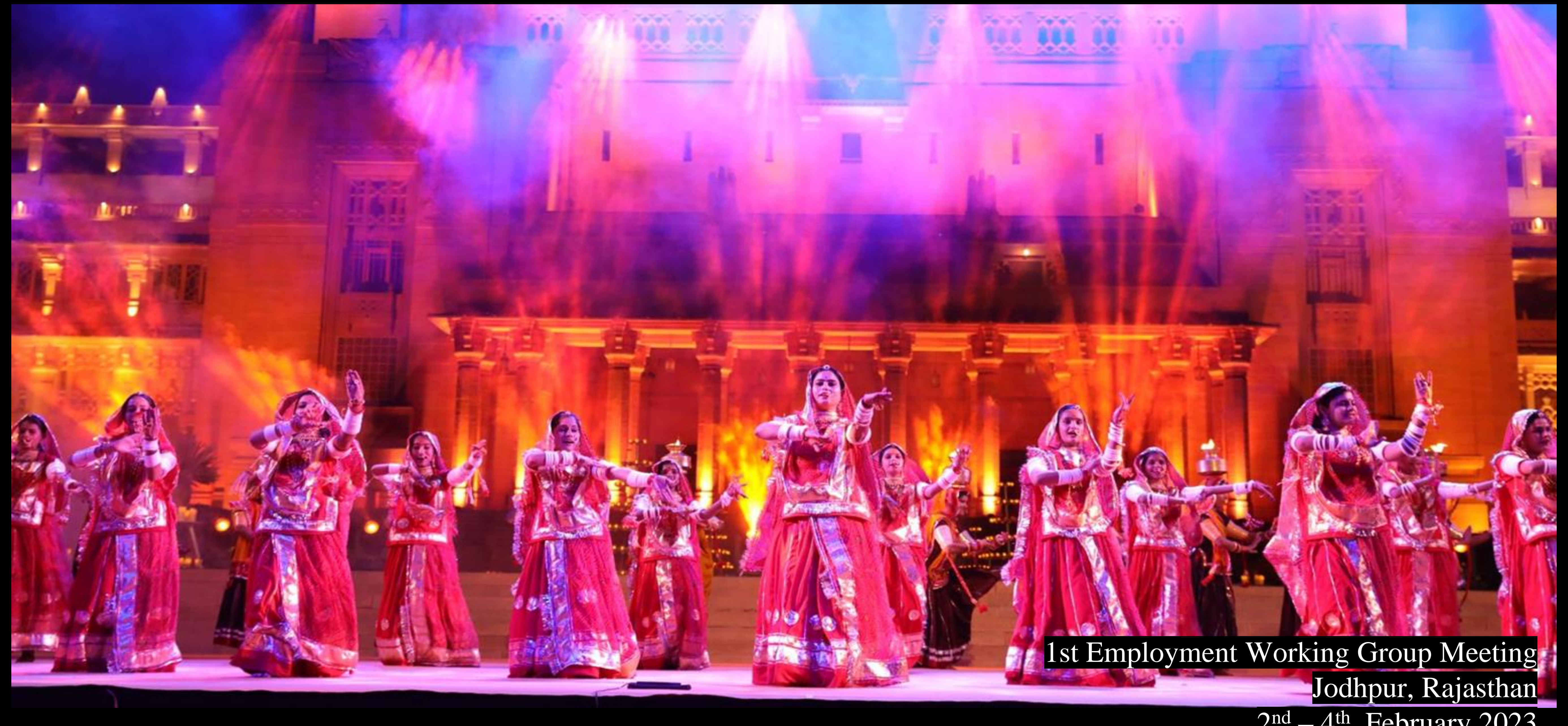
2<sup>nd</sup> – 4<sup>th</sup> February 2023 Rajasthani Ghoomar Dance